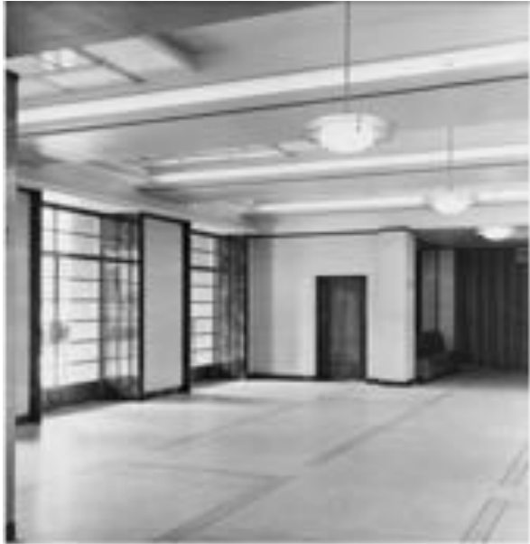
158 Assembly Hall, c. 1935