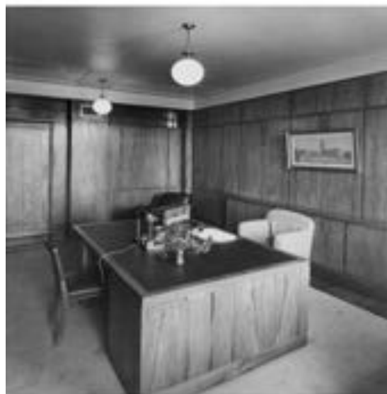
157 Borough engineer's office, c. 1935 (RIBA)