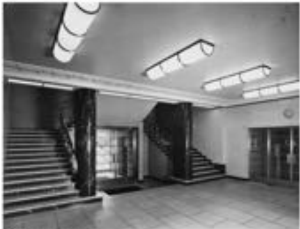
156 Main entrance hall, c. 1935