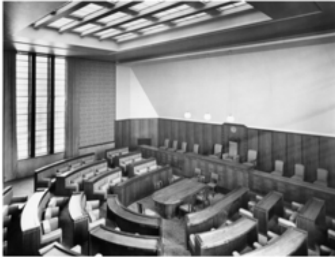
18A Council Chamber, 1935 (P&O)