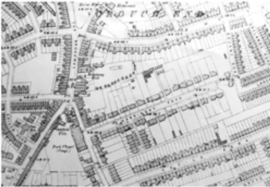
1894 Ordnance Survey map