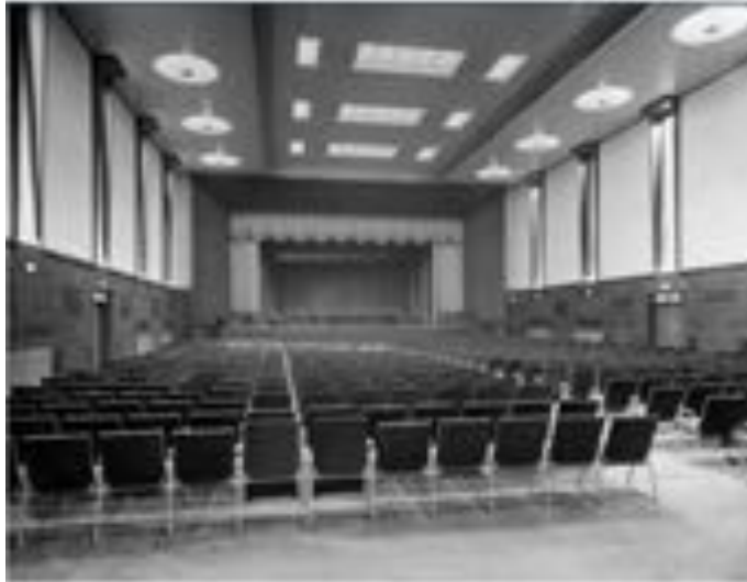
18C Assembly Hall, 1935 (P&O)