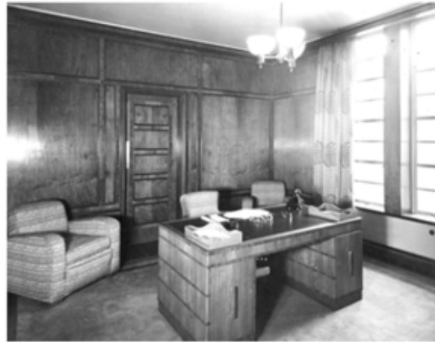
159 Mayor's parlour, c. 1935