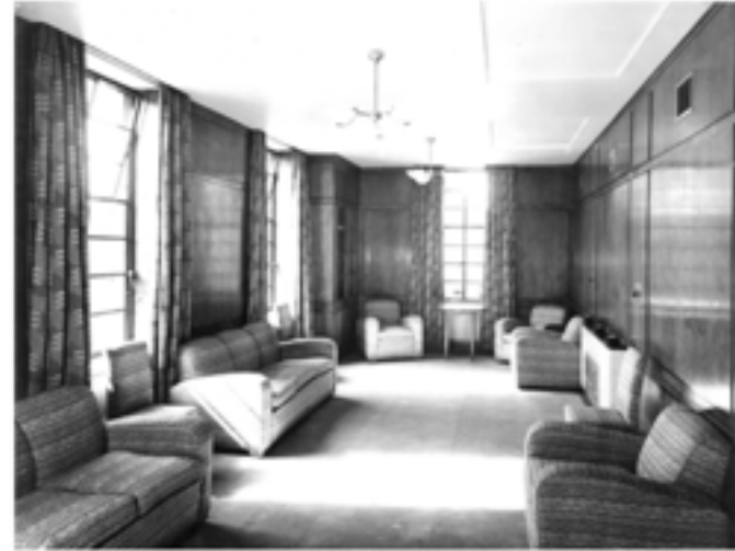
18B Embassy Room, c. 1935 (P&O)