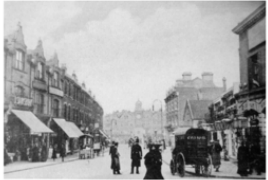
Crouch End Broadway c. 1905