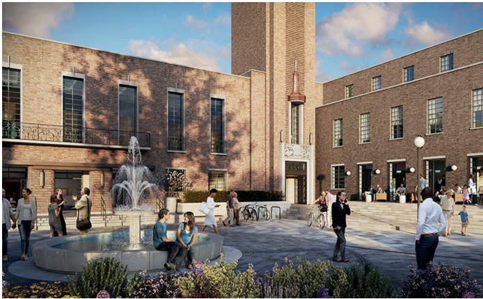
CGI OF THE TOWN SQUARE

Welcome to the Summer 2020 edition of the Hornsey Town Hall Community Newsletter, giving you an insight into what's happening on and around the site as restoration and construction continues. During this difficult time, we are thinking of the whole community, in particular those individuals and businesses directly impacted by COVID-19.