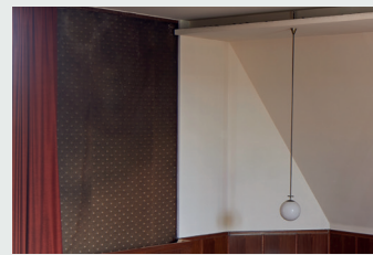
THE TAPESTRY AS FOUND IN 2017