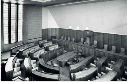
COUNCIL CHAMBER 1935

Hornsey Town Hall's Council Chamber is one of the many principal spaces of the building steeped in history. In the past, council chambers in many Town Halls were important spaces in the buildings' interiors. This photograph from 1935 shows a number